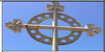
Mary Immaculate Church EMU PARK