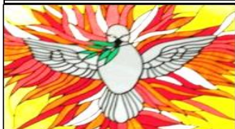
Sacred Heart Church YEPPON