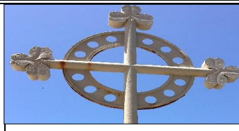
Mary Immaculate Church EMU PARK