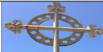
Mary Immaculate Church EMU PARK

Facebook: www.facebook.com/capricorncoastcatholicparish