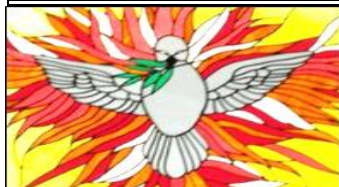
Sacred Heart Church YEPPON