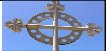
Mary Immaculate Church EMU PARK

Facebook: www.facebook.com/capricorncoastcatholicparish