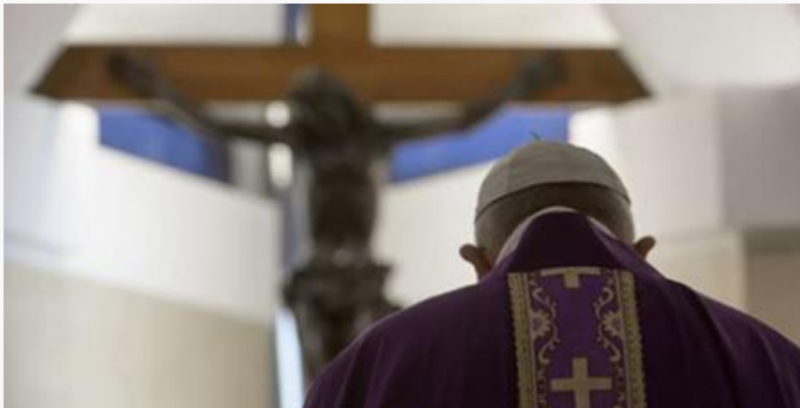
Pope Francis celebrates Mass in the chapel of the Casa Santa Marta during Lent last year

Pope Francis has encouraged Catholics to practise charity during Lent this year by caring for those affected by the coronavirus pandemic. Source: CNA.