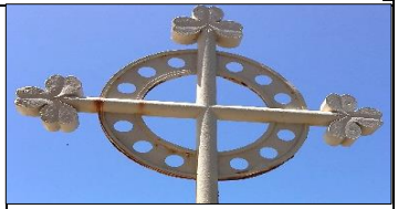
Mary Immaculate Church EMU PARK