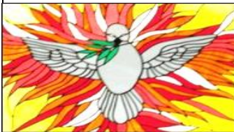
Sacred Heart Church YEPPON