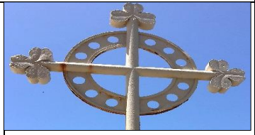
Mary Immaculate Church EMU PARK