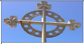
Mary Immaculate Church EMU PARK