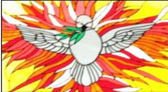
Sacred Heart Church YEPPON