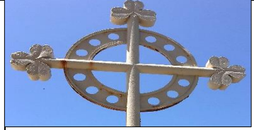
Mary Immaculate Church EMU PARK