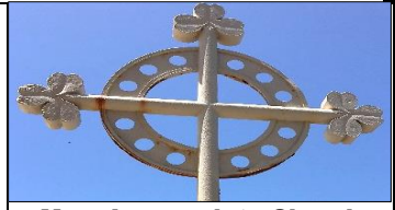
Mary Immaculate Church EMU PARK