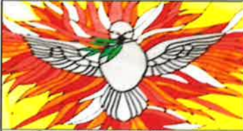
Sacred Heart Church YEPPOON