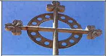
Mary Immaculate Church EMU PARK

Facebook: www.facebook.com/capricorncoastcatholicparish