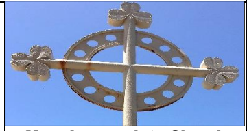
Mary Immaculate Church EMU PARK

Facebook: www.facebook.com/capricorncoastcatholicparish