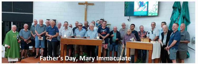
Father's Day, Mary Immaculate

Why are you jealous because I am generous.