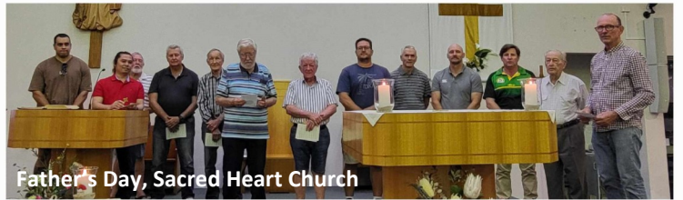
Father's Day, Sacred Heart Church