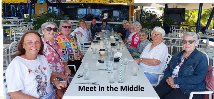
Meet in the Middle