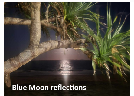
Blue Moon reflections