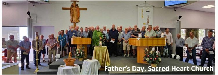
Father's Day, Sacred Heart Church