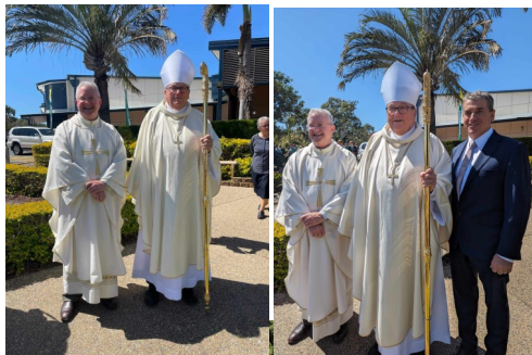
Christian Brother's Farewell Mass, St Brendan's College