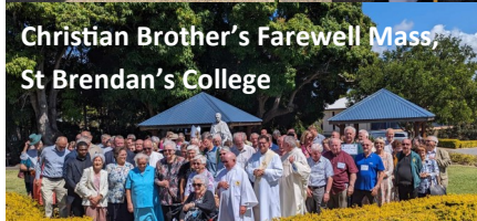
Christian Brother's Farewell Mass, St Brendan's College