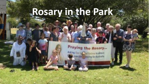
Rosary in the Park