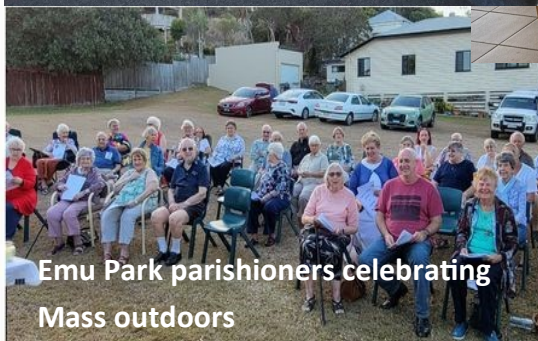
Emu Park parishioners celebrating Mass outdoors