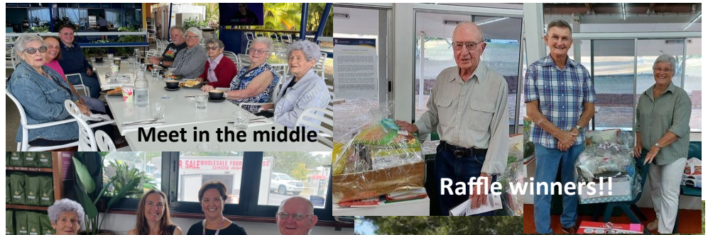
Meet in the middle