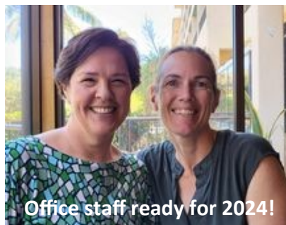
Office staff ready for 2024!