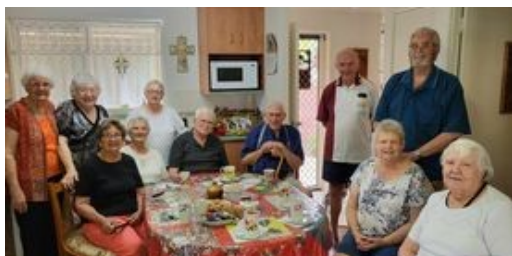
AROUND THE PARISH