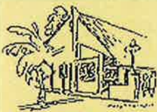
Mary Immaculate Church 38 Archer Street EMU PARK QLD 4710