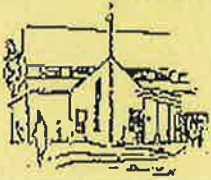
Sacred Heart Church 7 Tabor Drive LAMMERMOOR QLD 4703